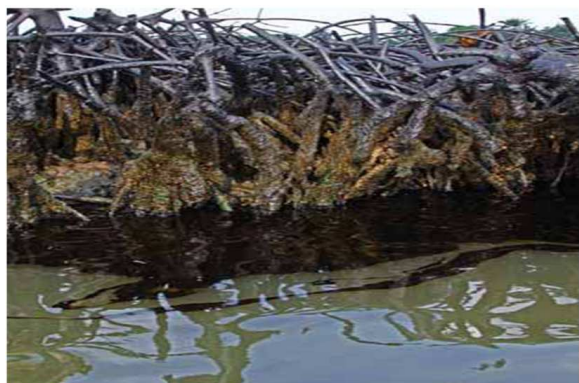
Fig. 1: Mangrove roots heavily coated with a thick layer of bituminous substance in Bonny, South-South, Nigeria

Different levels of heavy metal concentrations have been reported in Nigerian water bodies by several workers. Obire et al. (2003) on Elechi creek, Omoigberale and Ogbeibu (2005) on Osse River, Southern Nigeria. Ogbeibu and Victor (1989) amongst other Nigerian or indigenous scholars have advocated the use of fish and invertebrates as bio-indicators of water quality. A considerable amount of studies has been carried out on the effects of pollution in Nigerian water bodies. Victor and Tetteh (1988) reported a reduction in fish diversity associated with discharge of municipal wastes and industrial pollutants into the Ikpoba River, while Fufeyin (1998) studied heavy metal concentration in some dominant fish in the river and reported that the fish species showed higher mean levels, with variable contamination factor and bioaccumulation quotient among stations. However, the UNDP Report (2011) documented that the concentrations of PAHs in biota were low in all samples in Ogoniland. In fresh fish and seafood, concentrations were below the detection limit for most of the different PAHs. In a few cases, measurable but low levels were found. This investigation showed that the accumulation of hydrocarbons in fish tissue is not a serious health risk in Ogoniland.