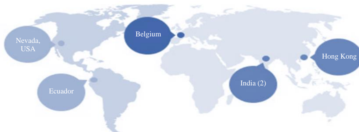
Fig. 1: Location of initial reinfection cases in the world