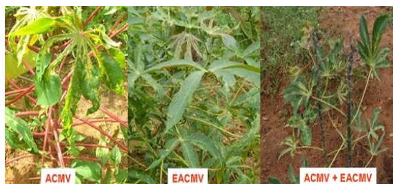
Fig. 1: Various symptoms caused by cassava mosaic Begomovirus disease in the different cassava production areas in Togo: Leaf curling symptom with yellowing caused by ACMV on a local cultivar Yovovi; Leaf curling symptom caused by EACMV on a selected cultivar “KH 1 04” and leaf curling symptom small leaves caused by ACMV in mixed infection with EACMV on a selected cultivar KH 1 04

Phylogenetic analysis: CP gene sequences were considered for this analysis due to their importance for Begomoviruses replication gene expression [14] . The phylogenetic tree was estimated using the neighbor-joining method [13] with the Unweighted Pair-Group Method with Arithmetic average (UPGMA) distance matrix (MegAlign program).