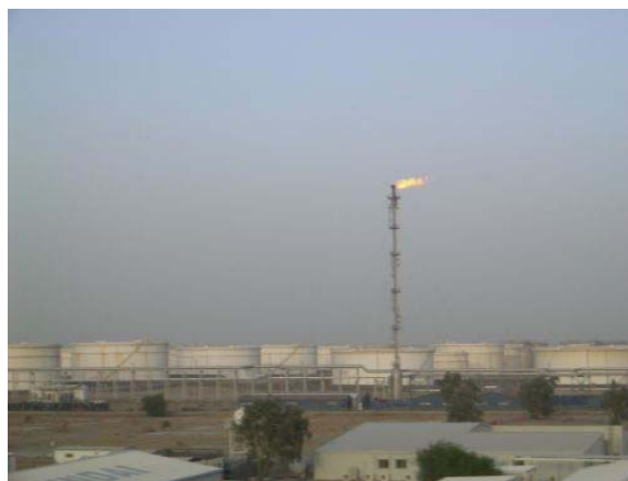
Fig. 1: Oil tank farms in Kuwait

for open inspection based on different capacity and construction type. As a result, a well-devised maintenance schedule of storage tanks will substantially help the leaseholder increase revenue attributed to the availability of tanks but assure the statutory reserves without constructing new tanks.