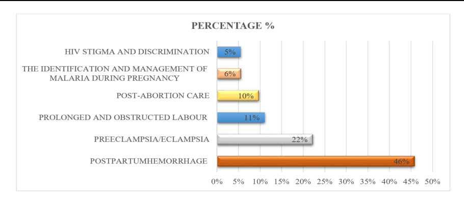
Fig. 1: Relevance of the Skoool<sup>TM</sup> E-learning course content