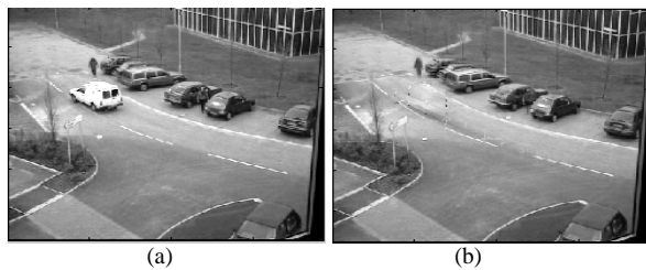
Fig. 2: Proposed algorithm. (a) 100th frame; (b) Final extracted background

These values for the reference algorithm are displayed in Fig. 3. The quality of subfigures shows that the performance of the proposed algorithm is acceptable.