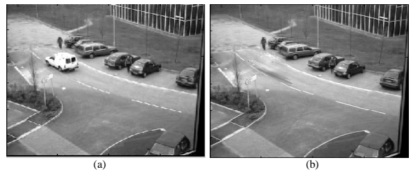
Fig. 3: The Extracted background by reference 0 (a) 100th frame; (b) Final extracted background