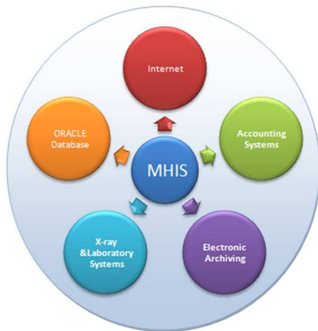
Fig. 2: System processes

The eighth phase is concerned with developing medical information systems to cope up with enormous developments in IT domain. Fig.1 flow chart for following up health operations concerned with patients, Fig. 2 processes of information systems to internal systems of hospitals, Fig. 3 Analysis Types Report (Laboratory). Figure 4 Patients Data Form and new file entry and opening.