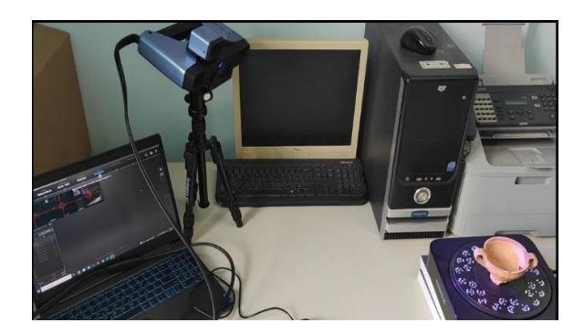
Fig. 1: 3D scanning apparatus set-up

The dedicated software for the obtained mesh refinement operations and the final extraction of the 3D printable CAD file was the software "EXScanPro-3.7.4.0" developed by shining 3D^{TM} . Figure 2 depicts a screenshot of the aforementioned process upon the completion of the 3D scanning process.