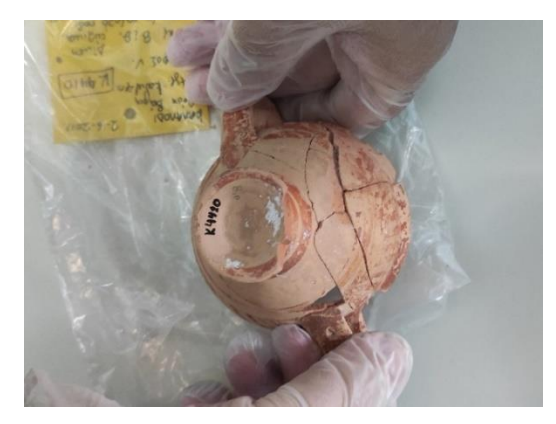
Fig. 5: Alabaster K4410