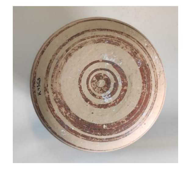
Fig. 4: Alabaster K4365