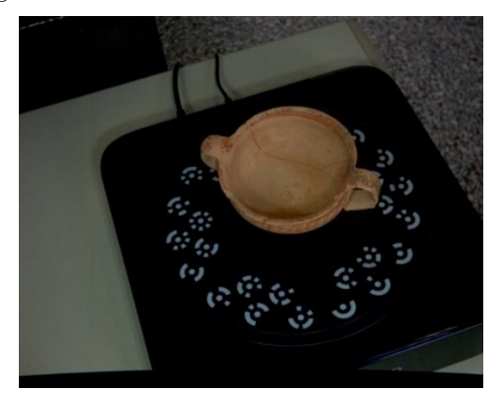
Fig. 7: Alabaster K4410 during 3D scanning procedure