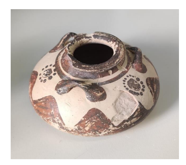
Fig. 3: Alabaster K4364

Regarding the artifacts, the four vessels examined are only a part of the wider archaeological context of the findings uncovered inside the monumental chamber-tomb T.I. that had a rectangular shape and a pitched roof. The alabasters (K 4364, K 4365) (FS 84) are decorated with a rock pattern (FM 32), the small goblet (K 4410) FS 254 is decorated with a foliated band (FM 64), and the early sample of the carinated conical cup (K 4909) FS 230 also decorated with rock pattern (FM 32). All vessels are made of high-quality clay, probably manufactured in a local Mycenaean ceramic workshop and the color of the decoration varies from dark brown to light orange. Figures 3-6 depict each one of the aforementioned alabasters.