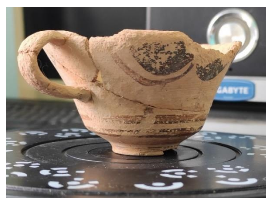
Fig. 6: Alabaster K4909