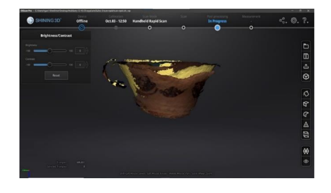
Fig. 2: Screenshot of the 3D scanning post-processing procedure