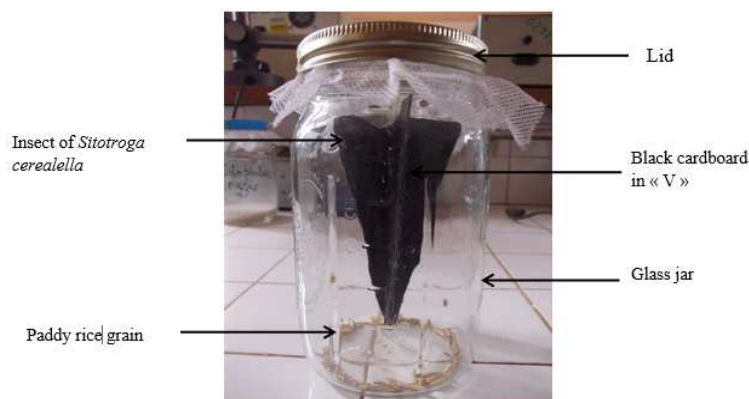
Fig. 1. Device of collection of the ovums of Sitotroga cerealella