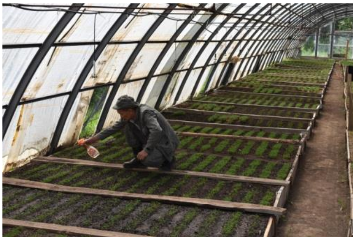
Fig. 5. Spraying with Deltaspray during the growing season