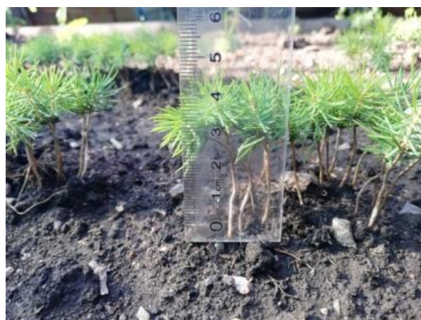
Fig. 2: Annual seedlings with the application of Gumi-K

Based on the results obtained in the summer and the autumn, the main biometric growth indicators of the seedlings of Schrenk's spruce were calculated (Tables 2 and 3).