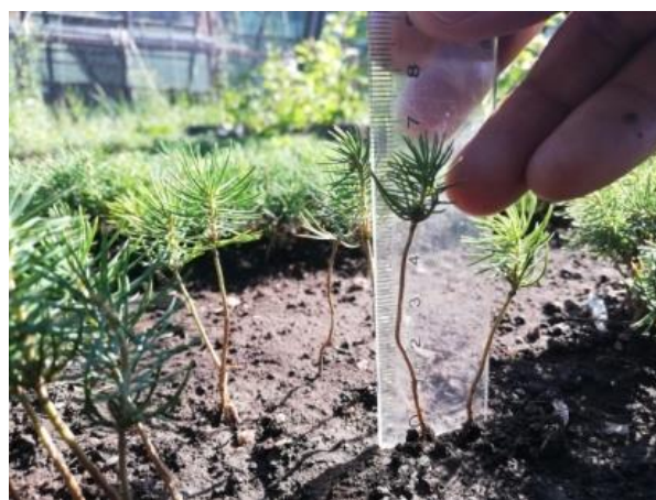
Fig. 3: Annual seedlings with the application of phytobacirin